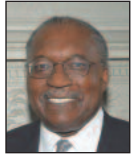
FOR OHIO SUPREME COURT BEN ESPY