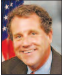
FOR U.S. SENATE SHERROD BROWN