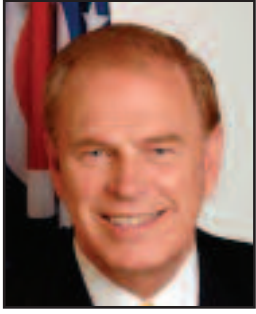
FOR GOVERNOR TED STRICKLAND