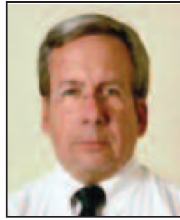
FOR OHIO SUPREME COURT WILLIAM O'NEILL